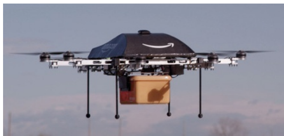
Retail juggernaut Amazon has promised it will launch some form of aerial drone package delivery to augment its traditional ground-based service.

Drones have a foothold in today's aerial-vehicle marketplace—but air taxis are not far behind. One of