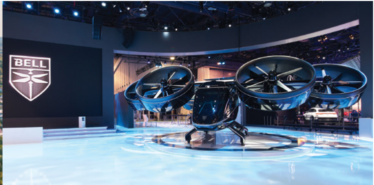
The Bell Nexus, a vertical-takeoff-and-landing (VTOL) air-taxi concept revealed at CES 2019 is powered by a hybrid-electric propulsion system incorporating six tilting ducted fans.

Privacy rights have also entered the discussion. One relates to surveillance; drones may capture images as they deliver their packages. There are also the myriad risks of drones trespassing on private property, colliding with other aircraft, or with ground vehicles and people, and otherwise causing damage and public nuisance. As the world saw recently with illegal drone activity at major U.K. airports, it is likely that more such issues will make headlines as companies begin to employ this technology in new ways.