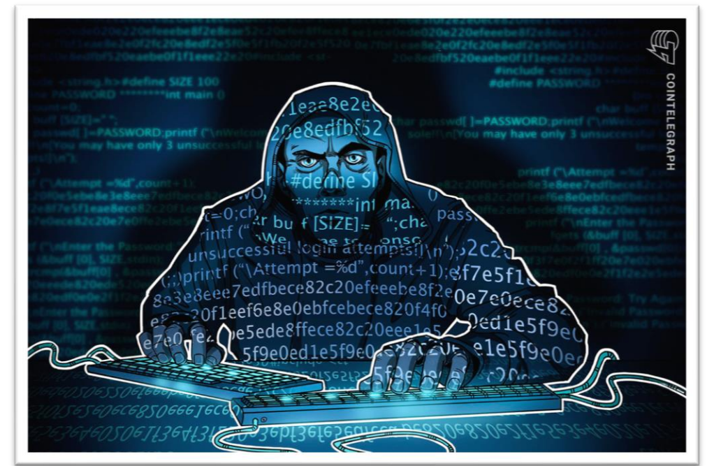
Source: Cointelegraph, Johannesburg Authorities Refuse to Pay Hackers' Bitcoin Ransom (Oct. 30, 2019)